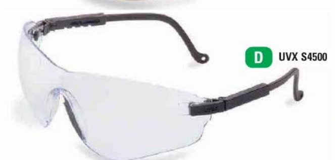
D UVX S4500