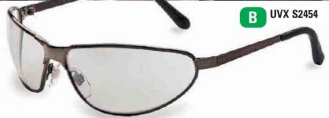
B UVX S2454