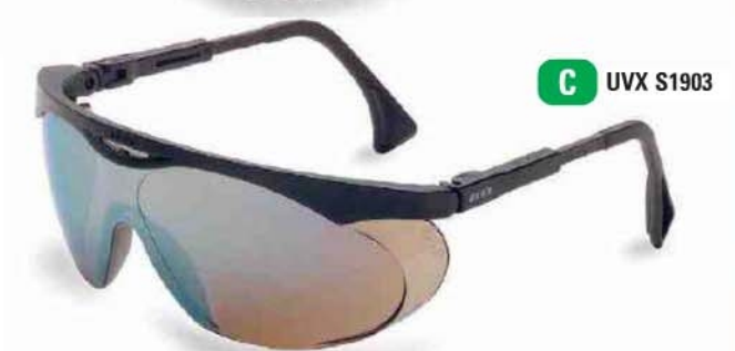
C UVX S1903