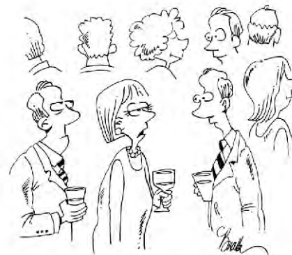
"Our son is at that awkward age where he's living in our basement."

If a doctor has not recommended low-dose aspirin, avoid taking it routinely. Aspirin can cause bleeding, particularly in the gastrointestinal tract.